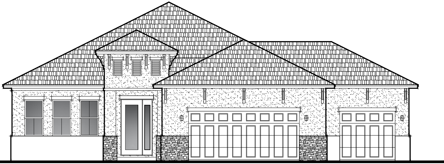
Botichelli - Traditional 3F Smith Custom Home Corporation

Note: Design Illustration shown is conceptual only. Some items may be changed at production stage.