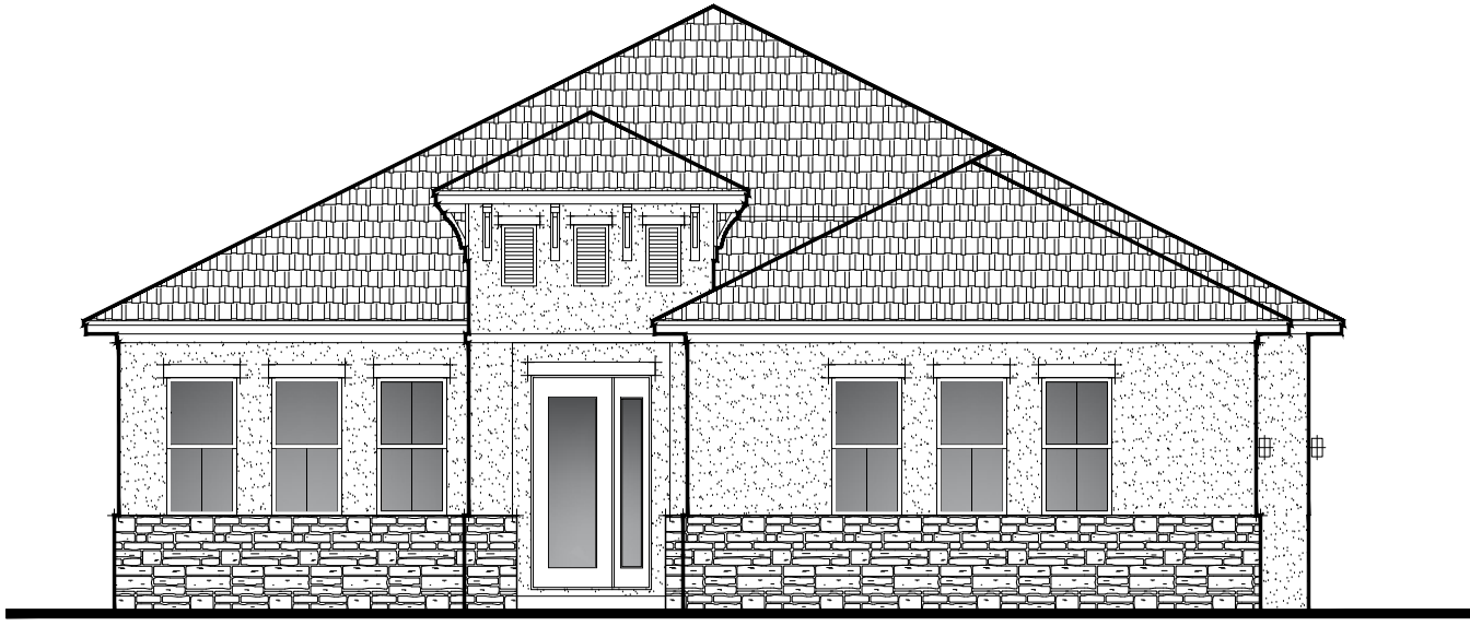
Botichelli - Traditional 3F Smith Custom Home Corporation

Note: Design Illustration shown is conceptual only. Some items may be changed at production stage.