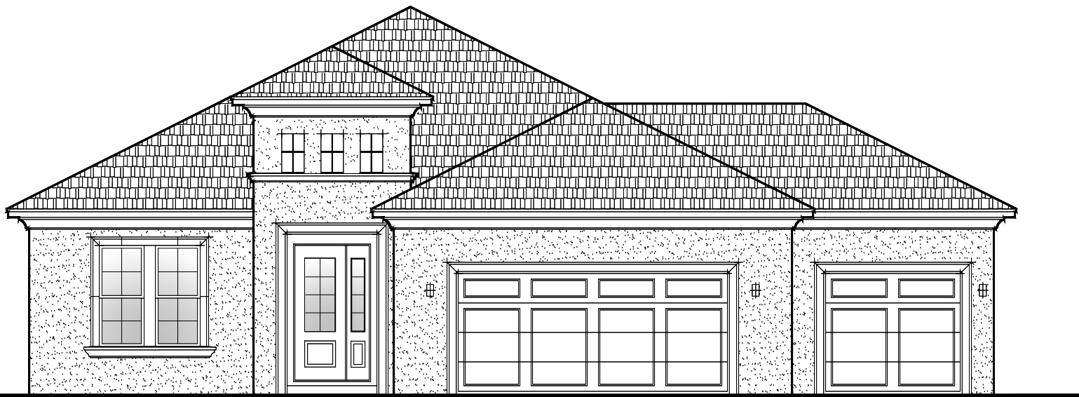
Botichelli - Mediterranean 3F Smith Custom Home Corporation