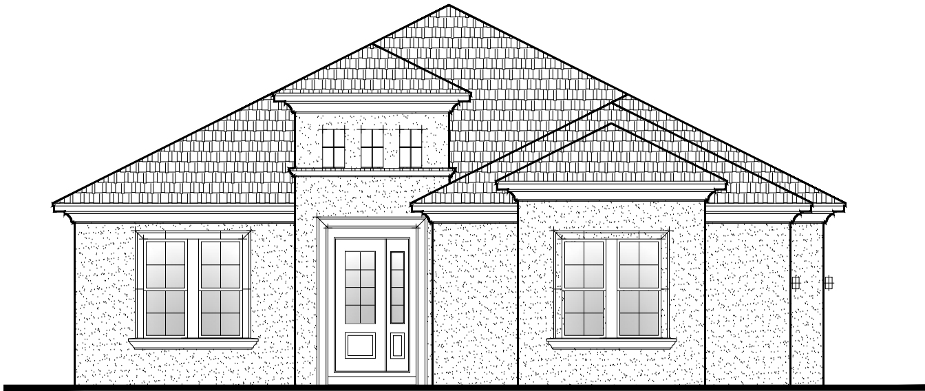
Botichelli - Mediterranean 3F Smith Custom Home Corporation