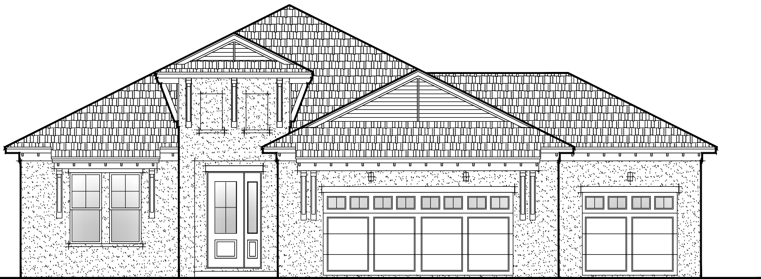
Botichelli - Caribbean 3F Smith Custom Home Corporation