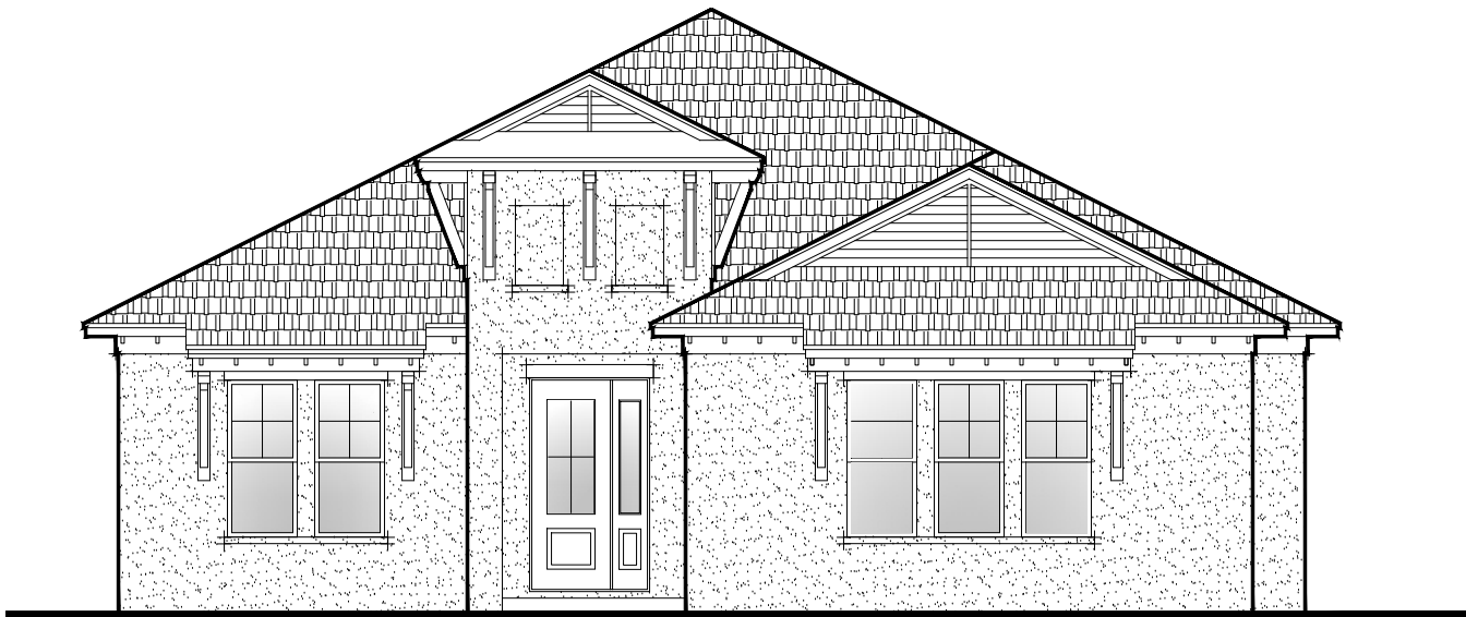
Botichelli - Caribbean 3F Smith Custom Home Corporation