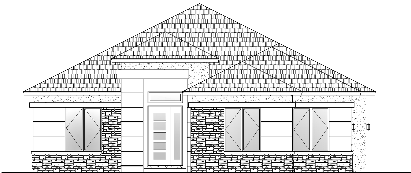
Botichelli - Transitional 3S Smith Custom Home Corporation

Note: Design Illustration shown is conceptual only. Some items may be changed at production stage.